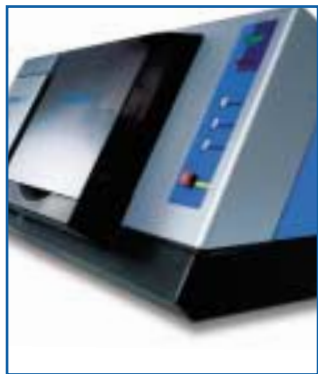
SCAN AND MILLING UNIT

Only following the further development of research by the renowned Eidgenössische Technische Hochschule Zürich, Switzerland, is the economic use of this material possible.