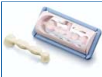
MILLED ZIRCONIUM OXIDE BLANK AND THE SINTERED FRAMEWORK

given its final appearance by coating it with porcelain in the specific shade of your own teeth. To ensure this system works smoothly, all components come from a single manufacturer, DeguDent.