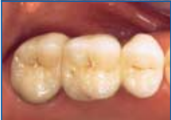
FRONT AND REAR CERCON RESTORATIONS